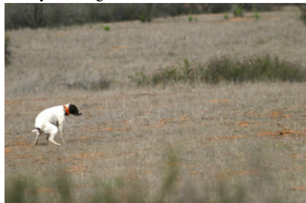
Annie demonstrates the Potty Point. There is actually a bird in the hole to the right. Upon completion of the big job the team walked right past the hole.