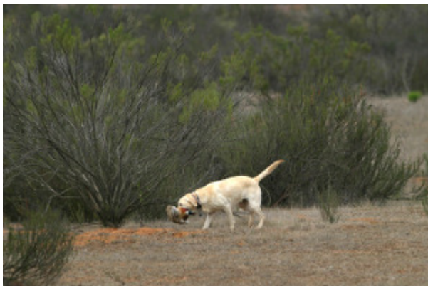
Team Tater gettin' it done!