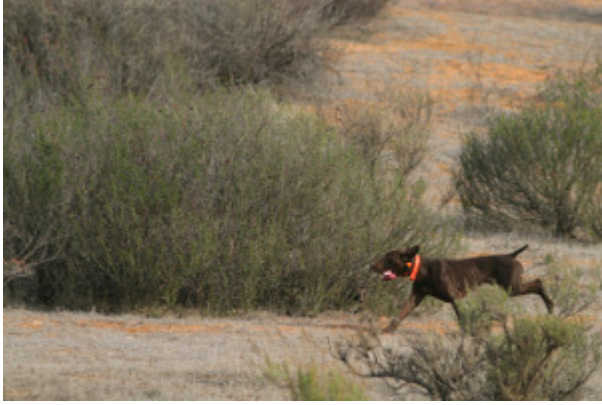
Rafael Aguilar's Remington at speed